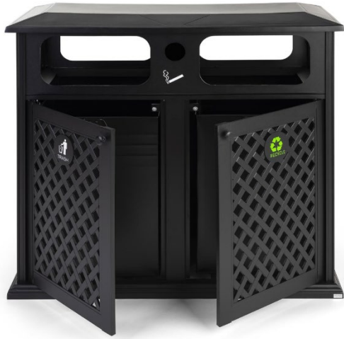
Image No. 1. Cast Aluminum Waste & Recycling Receptacle