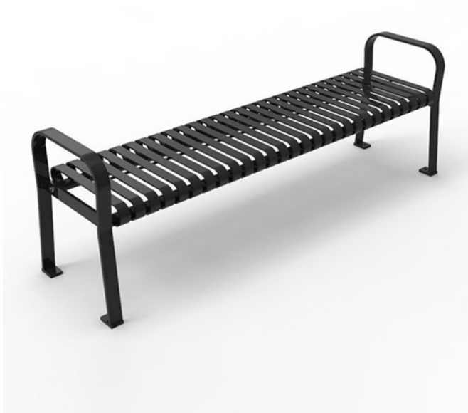
Image No. 5. Black Accessible Benches