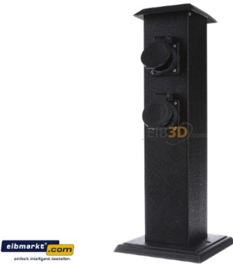
Image No. 2 Black Outlet Receptacle Pedestal