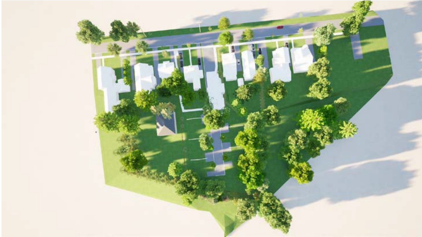
EXISTING - SEPTEMBER 21 6PM