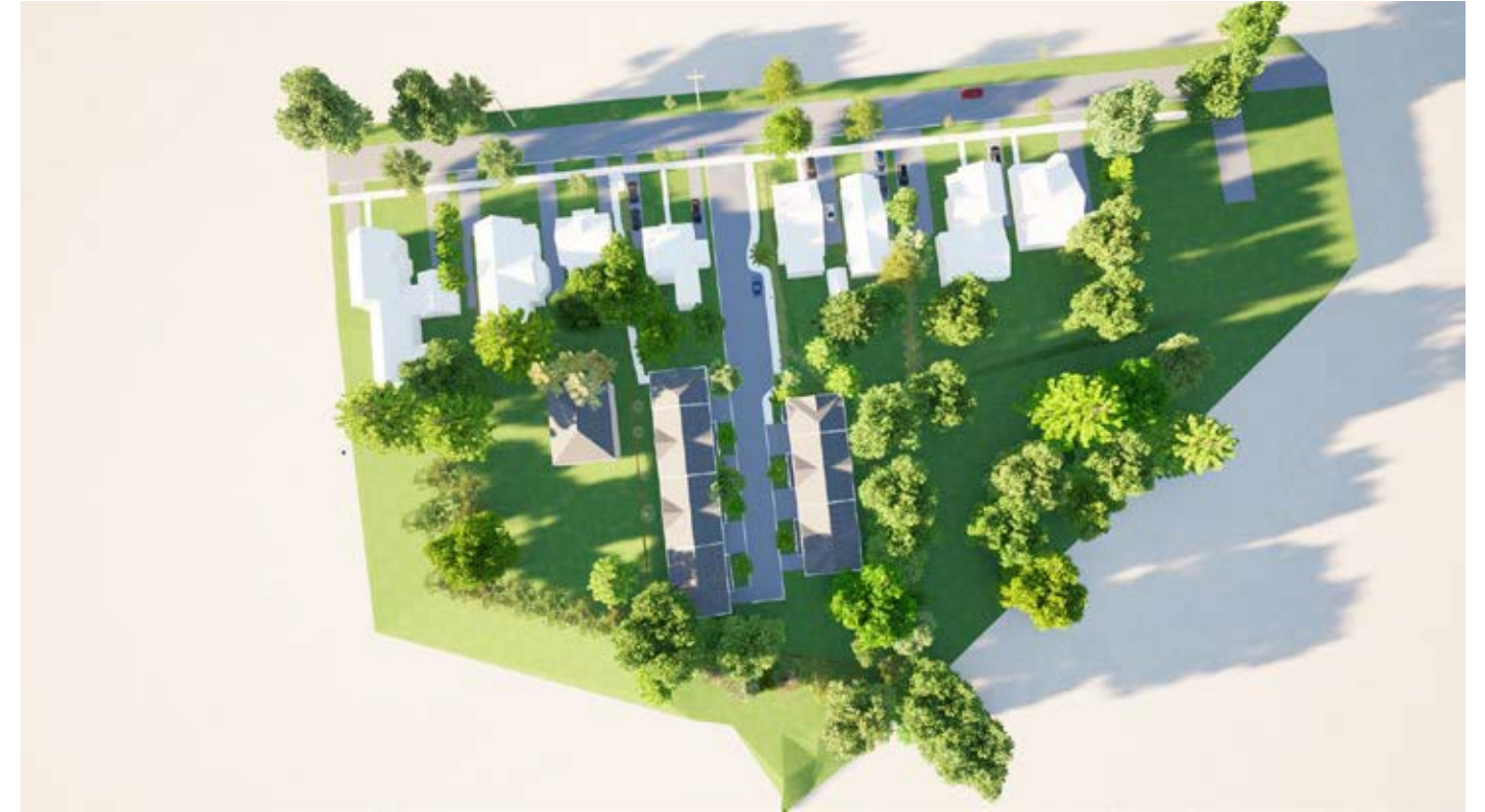
EXISTING - MARCH 21 6PM