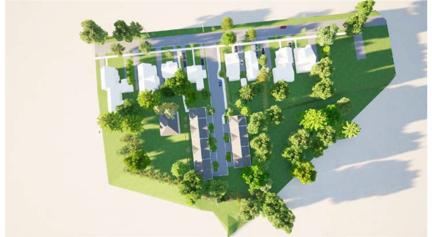
NEW - SEPTEMBER 21 - 6PM