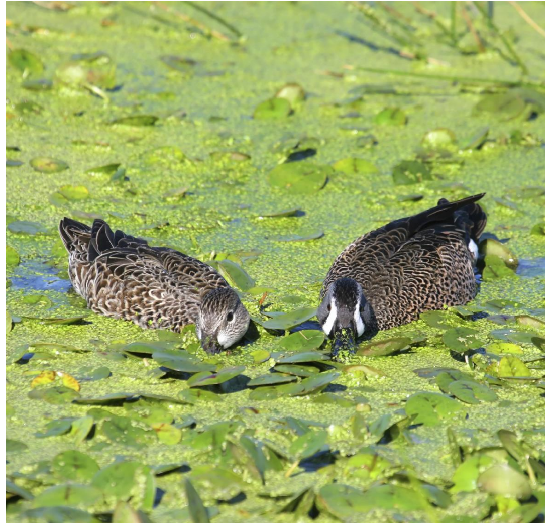
Blue-winged teal