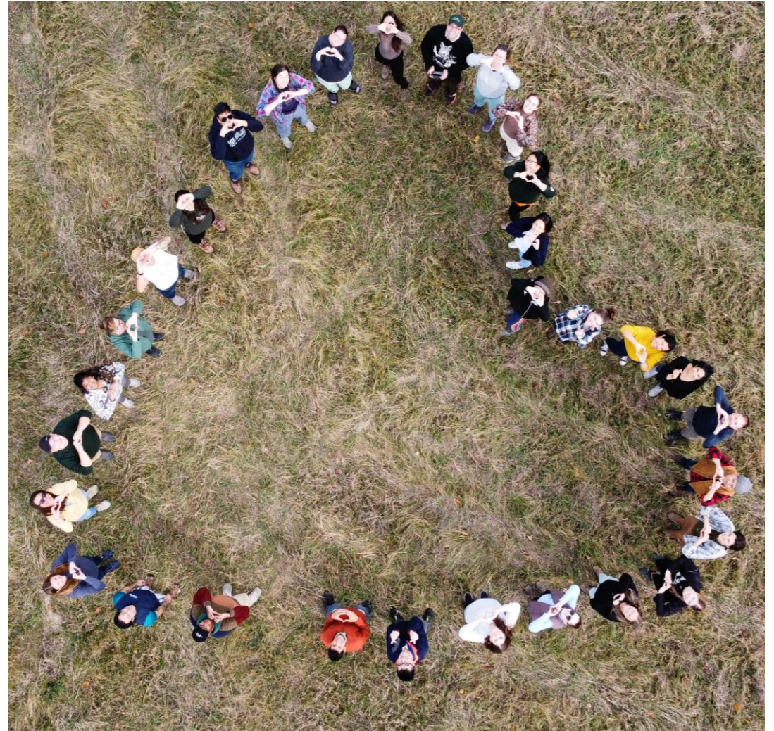
Ontario Nature staff photo 2024 © Noah Cole