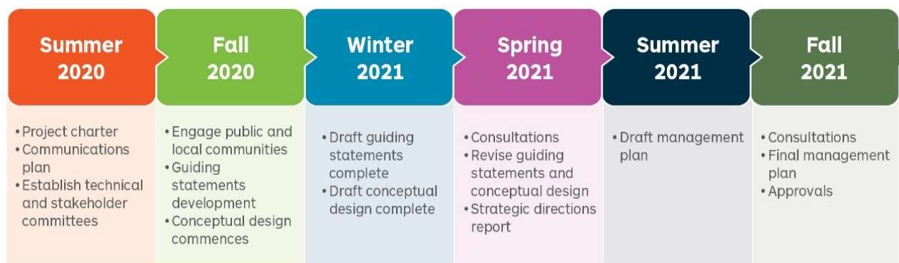
Figure 2: Island Lake Conservation Area Management Plan Project Milestones

It is anticipated that CVC's Board of Directors will approve the ILCA Management Plan by the end of 2021. CVC will then seek municipal council endorsements in Quarter 1 of 2022.