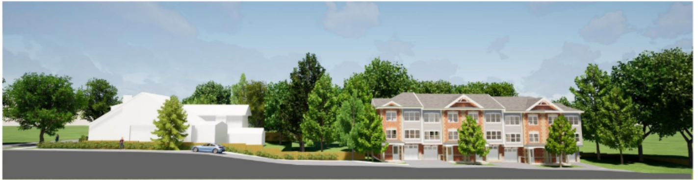
CONCEPTUAL SECTIONAL ELEVATION