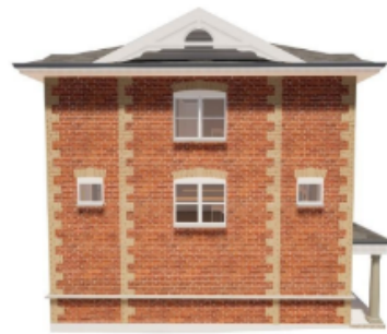
CONCEPTUAL END ELEVATION