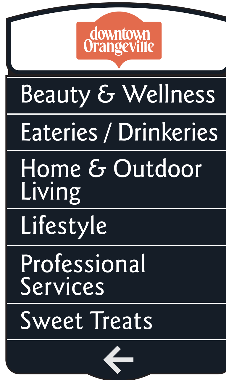
Side "B" Scale: 1 : 6