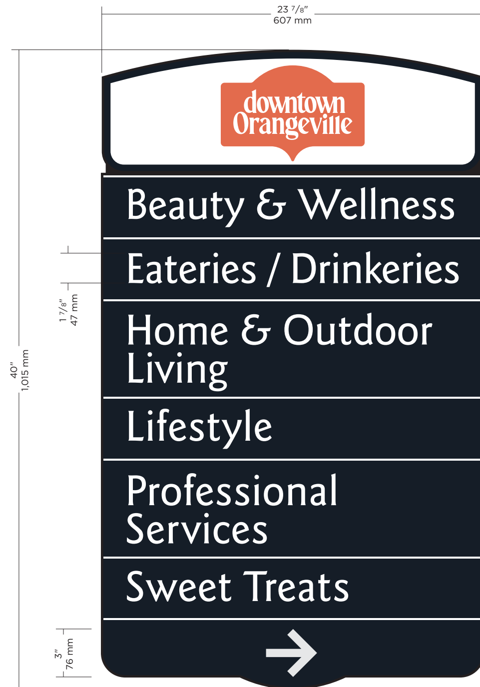
Side "A" Scale: 1 : 6