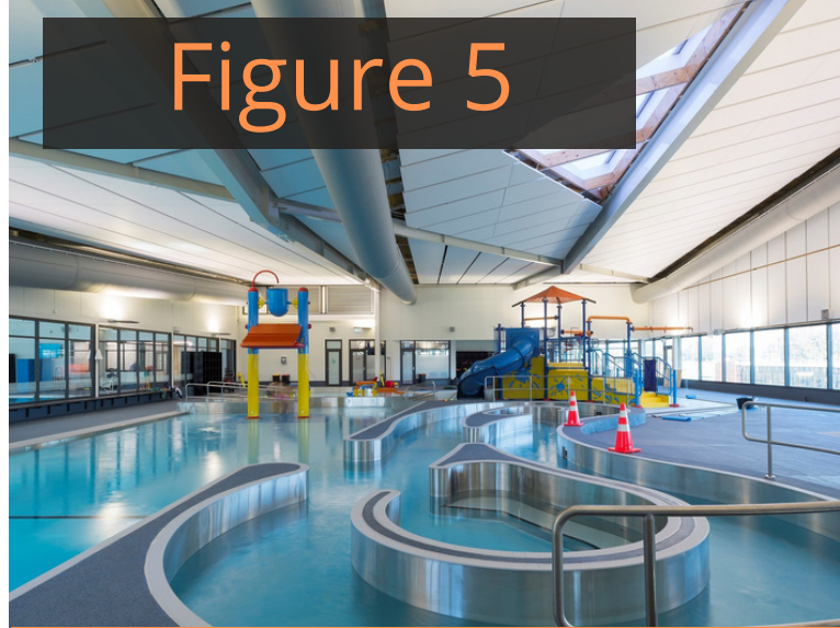
Polished Stainless Steel Leisure Pool - curved walls