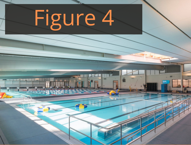
Polished Stainless Steel Lap Pool with Ramp