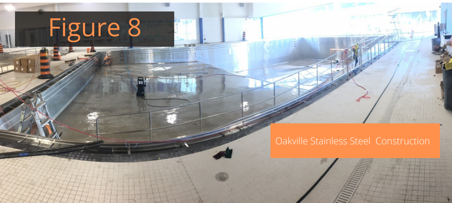
Oakville Stainless Steel Construction