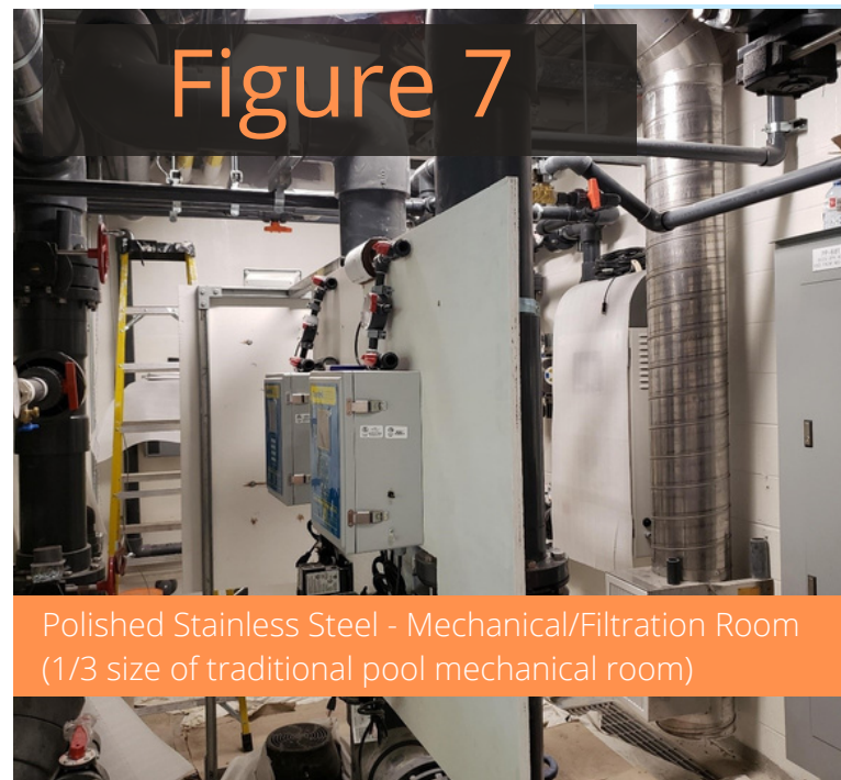
Polished Stainless Steel - Mechanical/Filtration Room (1/3 size of traditional pool mechanical room)